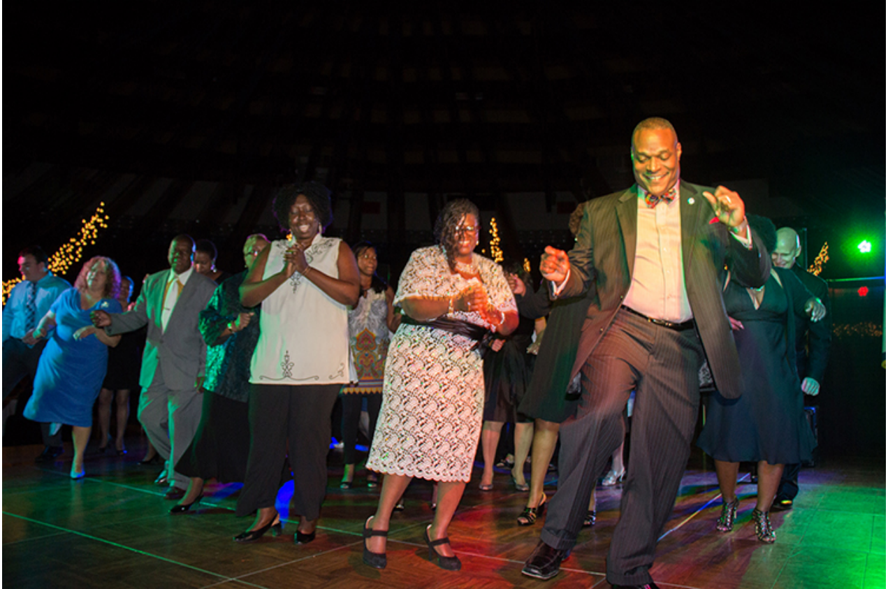
Faculty, staff, students and guests danced the night away at the Inaugural Gala